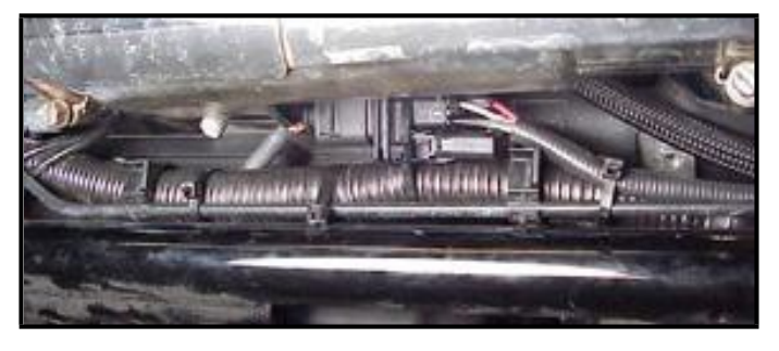
FL-N: Re-install the 50A fuse, replace the side covers.

FL-M: Position front connector above lower frame rail between engine and transmission. Attach to existing harness with provided wire ties. Inspect all wiring to make sure it is clear of moving parts and excessive heat.